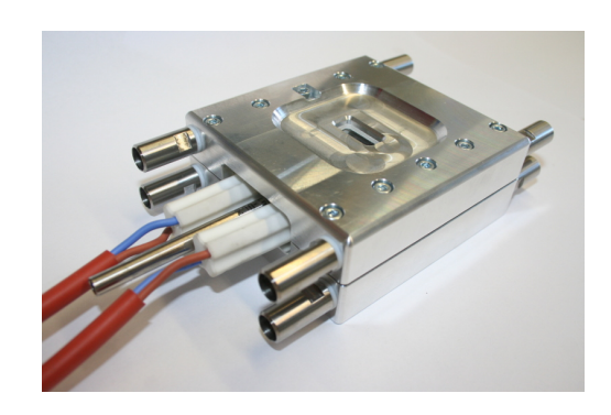
Figure 1: The heatable flow cell covered with a water cooled aluminum block.

So far the conductometric sensor principle is only used for on board particle detection to monitor the DPF in light duty vehicles. We hope that we are able to extend the use of the principle by this experminental setup for soot microstructure and reactivity analysis.